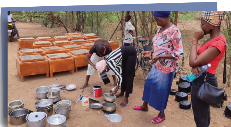
Solar ovens arrive at Kakuma Refugee Camp as women solar cooking champions prepare.

Thanks to you, 108 new ULOG solar box ovens are being built in Kenya for Kakuma Refugee Camp!