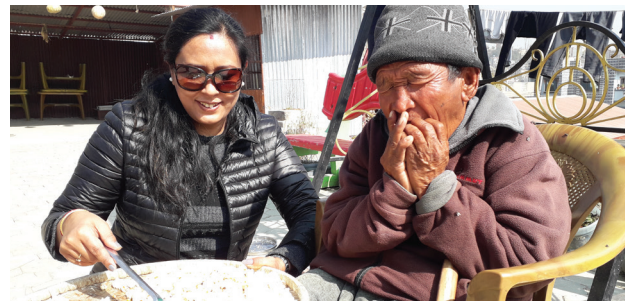
Seniors enjoy fresh popped popcorn from the cooking power of a parabolic solar cooker.

Thank you for supporting sustainability and self-sufficiency with solar cooking.