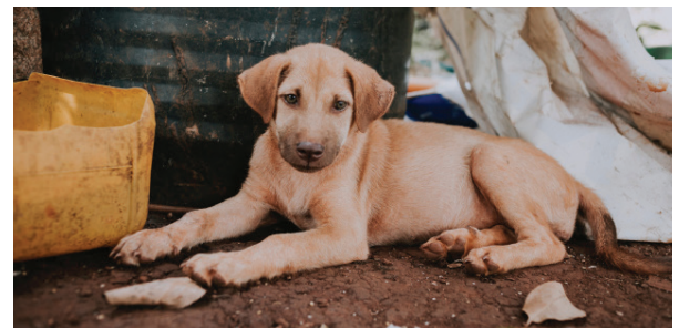
Your giving even helps sick and injured puppies.