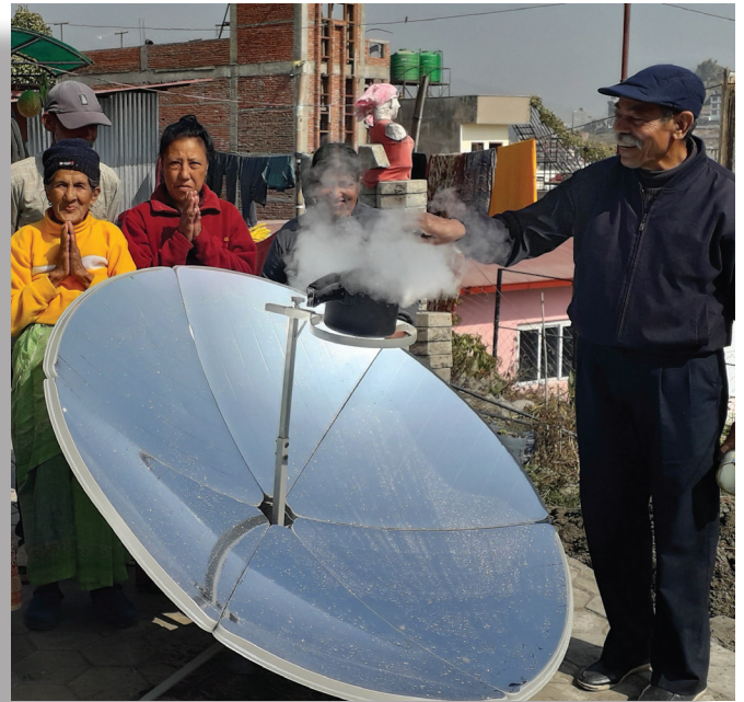
Senior citizens benefited by emissions-free solar cooking.

In addition, you have helped keep black carbon, created by polluting fuels like wood and charcoal, from melting the precious snow caps of the Himalayas. Keeping black carbon from forming in Nepal is crucial to stopping climate change.