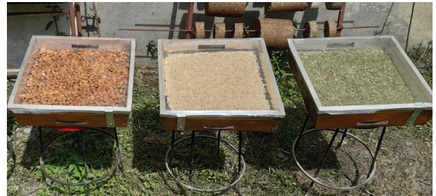
Solar dryers you provided to help seniors and animals in Nepal.