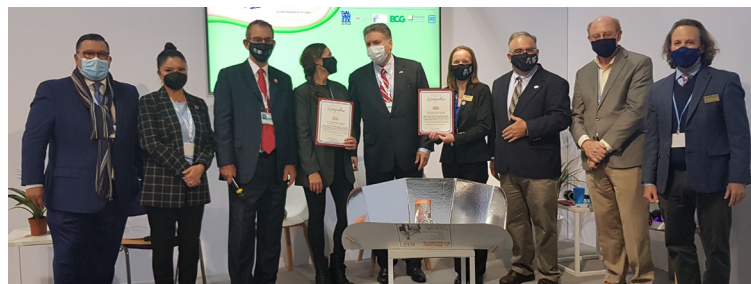
Solar Cookers International was honored with a resolution by California's State Legislature at COP26 in Glasgow, Scotland.

Because of you, Solar Cookers International (SCI) continues to advocate, research, and strengthen the capacity of the solar cooking sector. We are witnessing increased interest in and use of solar cookers around the world. Global leaders, policymakers, and people around the world are adopting solar cooking as a solution because of SCI's international media coverage, collaborations, and advocacy efforts with top global organizations, all made possible by you.