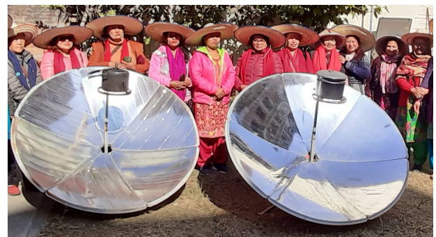
Women all around the world continue to see the positive impact of solar cooking thanks to your support.