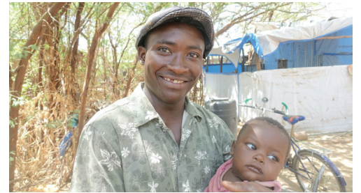
This solar cooking family is all smiles thanks to you.